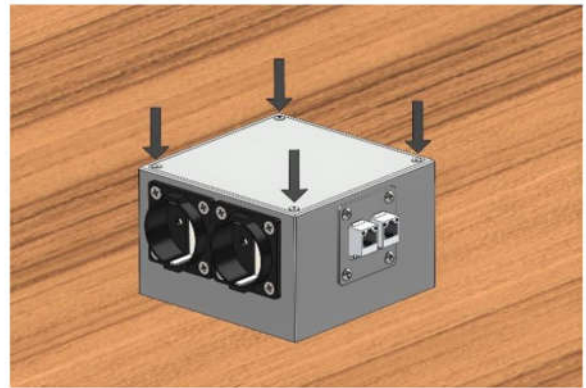
Release screws and remove lid